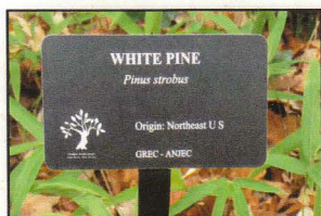
New identifying signs