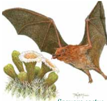
Lesser long-nosed bat

Hummingbirds are attracted to scarlet, orange, red or white tubular-shaped flowers with no distinct odors.