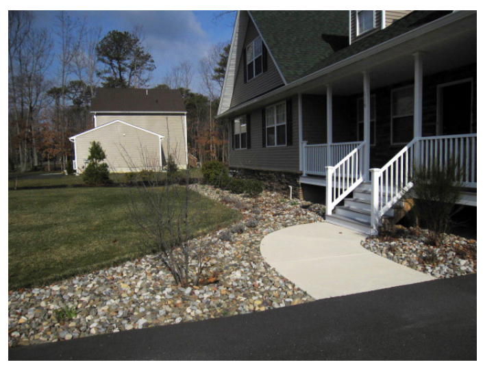
A home built to EPA's WaterSense specifications for new homes. The home pictured here in Egg Harbor Township, NJ is a new construction built to meet USEPA WaterSense guidelines for both indoor and outdoor water conservation. The landscaping is composed of 40% turfgrass and 60% water-conserving gardens. Project partners included New Jersey Water Savers, Doebley and Dad Construction Company, and New Jersey American Water Company.

For more information on the WaterSense program and WaterSense-qualifying landscaping, see USEPA (2009a), USEPA (2009b), USEPA (no date a), and USEPA 2009 (no date b).