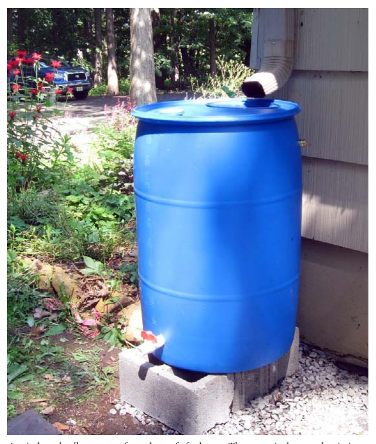
A rain barrel collects water from the roof of a house. The water is then used to irrigate ornamental plantings.

Collected rainwater is typically relatively good quality, and is suitable for irrigating ornamental plants. It should be remembered, though, that harvested rainwater may contain contaminants from atmospheric deposition or animal droppings, and so should be cautiously if at all for vegetable gardens (Mangiafico and Obropta 2011).