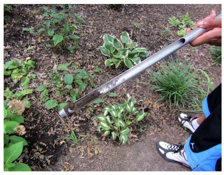
A soil probe can be handy to sample soil to determine how moist it is, as well as for extracting cores from the root zone for soil testing.