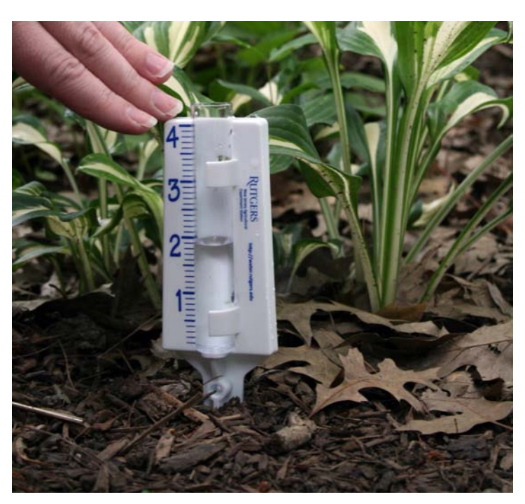
A small rain gauge installed in the Rutgers Cooperative Extension Water Resources Program demonstration rain garden in New Brunswick, NJ.

Another consideration for determining irrigation timing is that many municipalities throughout the state have adopted water ordinances restricting outdoor irrigation. Local ordinances typically have restrictions on the time of day or day of week that lawns can be watered. As the summer months approach, it is advisable to check with the municipality to verify that the irrigation schedule complies with local laws.