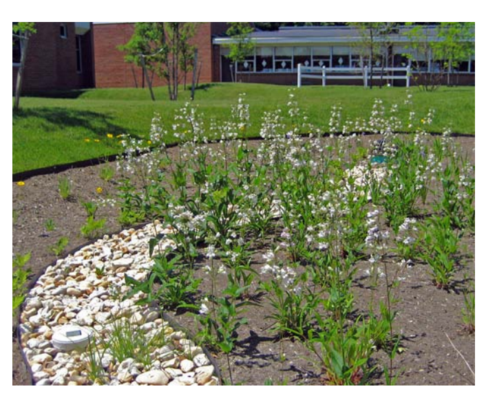
River stone is used to channel water through the demonstration rain garden at Village Elementary School in Holmdel, NJ. Stone can be used as a decorative, water-conserving landscape feature.