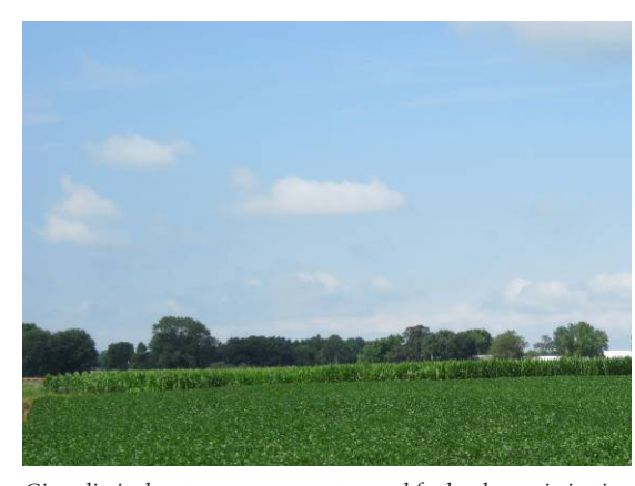
Given limited water resources, water used for landscape irrigation is not available for use in other beneficial uses like agriculture, recreation, and wildlife habitat.

If you determine that any of these conditions exist at your site, one solution is to choose landscape plants that have tolerance for growing in that condition. Alternatively, modifications could be made to the site or the soil to make the site more hospitable for the plants you desire. For example, low pH soils could be limed, compacted soils could be aerated, and droughty soils could be improved with compost or other organic matter.