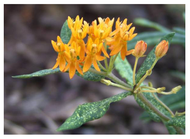
Butterfly weed, Asclepias tuberosa, is a native plant that attracts butterflies, hummingbirds, bees, and other insects.