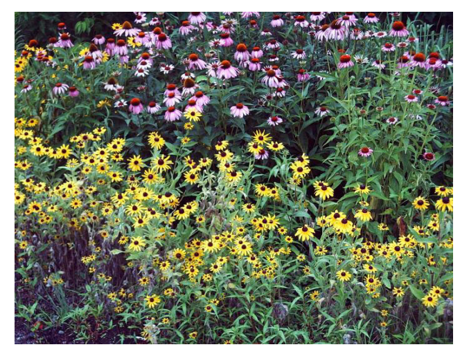
Black-eyed Susans and purple coneflowers, two drought-tolerant native flowers.

Table 13 lists drought tolerant plants. Most of those listed are native plants. For a list of plant nurseries that carry native plants in and around New Jersey, see Obropta et al. (2010) or visit the Native Plant Society of New Jersey's webpage on sources for native plants (npsnj.org/sources_native_plants.htm).