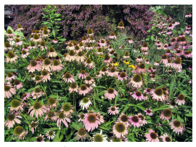
Eastern purple coneflower, Echinacea purpurea, is native to the eastern United States and Canada.