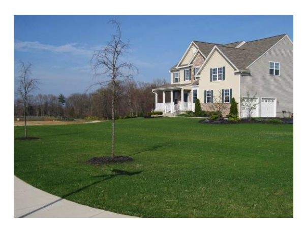
Residential properties with significant turf and other high water use landscape areas can consume large amounts of potable water for irrigation, especially in summer months.