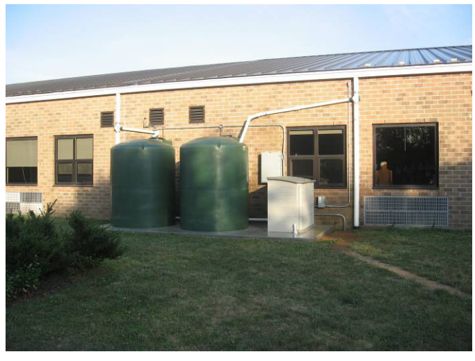
A larger rain harvesting system at Samuel Mickle School in East Greenwich, NJ. The collected water is pumped through an irrigation system that supplies an ornamental garden.