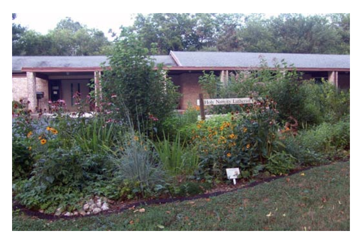
A rain garden at the Holy Nativity Lutheran Church in Wenonah, NJ.