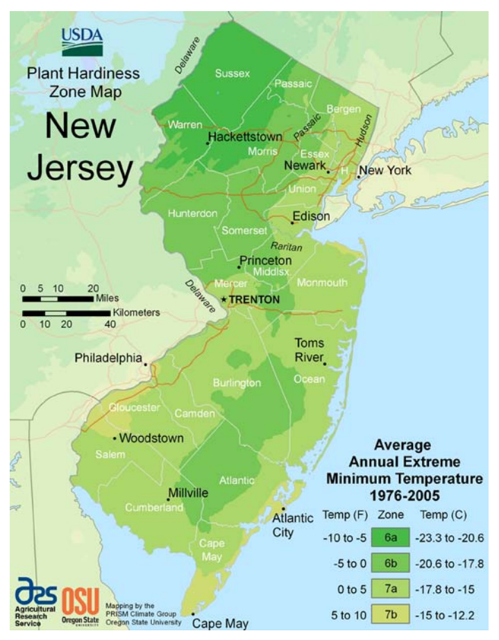
Figure 1. USDA hardiness zones for New Jersey, indicating the average of lowest winter temperatures for a given location. Note that elevation, topography, and microclimate can influence the actual coldest temperatures for a specific spot within a zone. Reproduced from USDA-ARS (2012). The complete map can be viewed at planthardiness.ars.usda.gov/.

There are a variety of books and websites on horticulture that are useful for collecting information about the preferences and tolerances of landscape plants you may be interested in. A few sources that may helpful be are given in Table 3, and a list of drought tolerant plants suitable for landscapes in New Jersey is presented in Table 13 at the end of this bulletin.