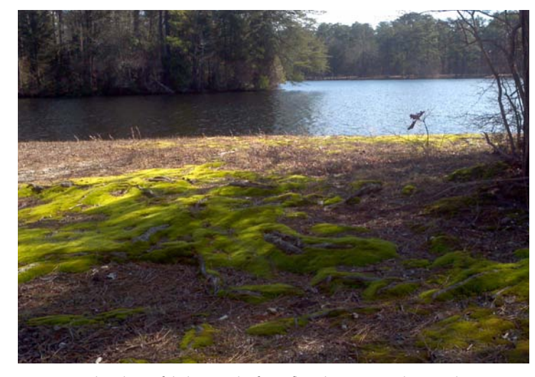
Moss can be a beautiful plant on the forest floor, but it is not always welcome in lawns and landscapes.

For more information on moss in lawns, see Costaris and Heckman (2004).