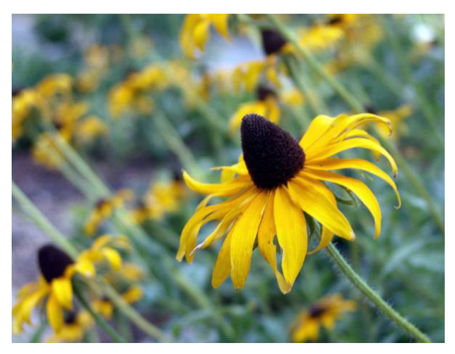
Black-eyed Susan, Rudbeckia hirta, is a native plant, and is also the state flower of Maryland.