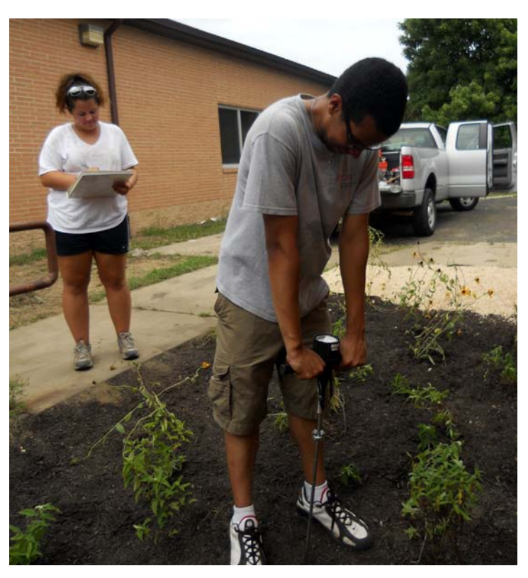
A hand-held penetrometer being used for precise measurements of soil compaction in a rain garden. The device is about three feet tall and has a dial on the top that reports soil strength in pounds per square inch.